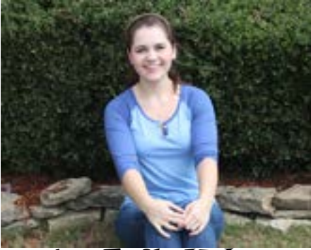
Editor: Emily Waters